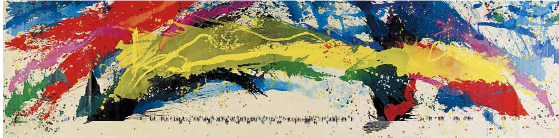
Chamoun, UNTITLED III, 2010, acrylic on canvas, 590 x140 cm

Prior to, during and after the barbaric July War of 2006, and up to my Desert Experience, I undertook several experiments in my painting. Some were a scream against the savage Israeli bombardment. These would be followed by another series of 'Water Reflections' a new experiment with the lakes of the Harriman and Tuxedo Park of upstate New York, followed in 2007 by a series of culturally inspired abstract works.