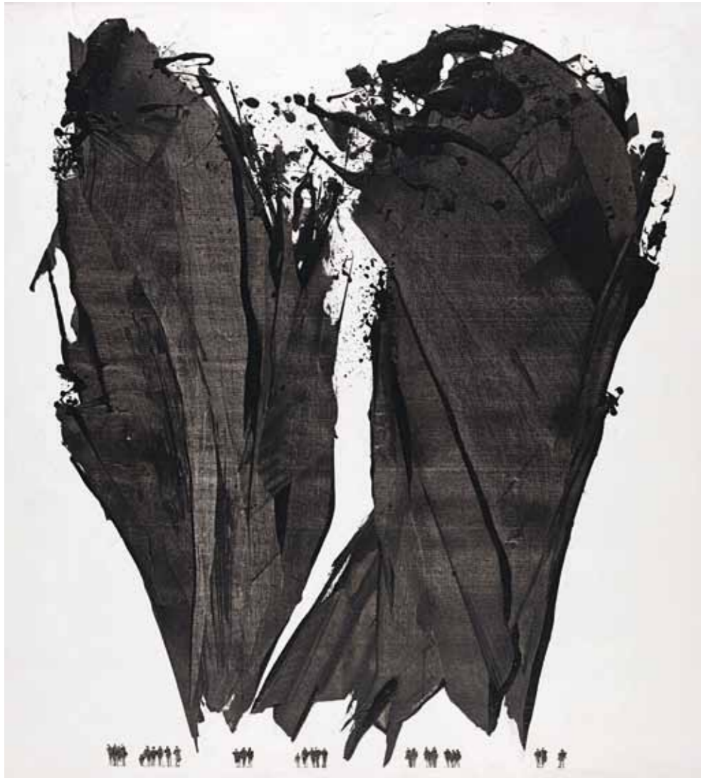
Chamoun, THE EIGHTH REBIRTH OF THE PHOENIX, 2006, acrylic on Canvas - 150 x 160 cm

Chamoun registered at CHRISTIE'S auction, 2007, a record sale for a living Lebanese artist, and was ranked by ART PRICE in the top 25 newly auctioned Artists world wide. In 2011, THE ARABIAN BUSINESS MAGAZINE named him one of the power-500 most influential Arabs in the World