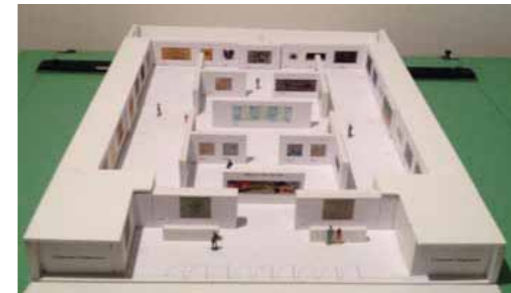
Chamoun, Beirut Exhibition Center, Exhibit Layout, March 7 - April 14, 2013

Chamoun, CHILDHOOD PLAYGROUND, acrylic on Canvas, 290 x 230 cm