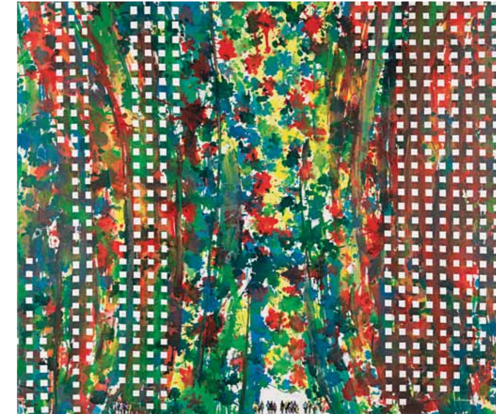
Chamoun, AN URBAN ENCOUNTER, 2007, acrylic on Canvas, 160x150 cm